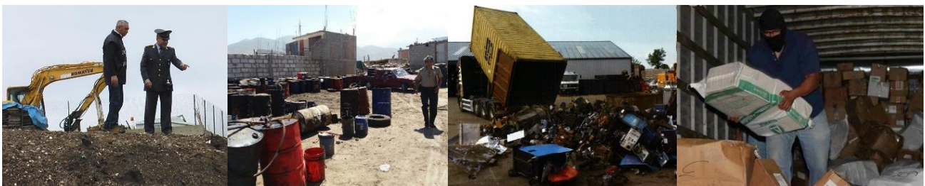
Illegal burial of diverse waste in Italy

The course of the Operation suggested that the waste law enforcement community needs to further develop capacity to conduct intelligence-led investigations and to share information across borders. Greater focus should be placed on targeting criminal networks and reaching successful prosecutions; shaping regional enforcement strategies adapted to the context; and supporting law enforcement in countries with limited resources and expertise. However, according to participating countries, a key factor in the success of the Operation was the strong engagement and good inter-agency cooperation at the national level, reflecting a holistic approach to waste crime.