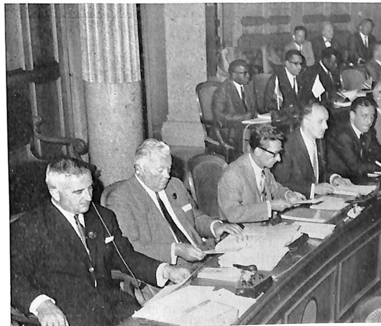
The Swiss delegation.

— International seminar on road traffic offences (March or April 1967) which had to be postponed because of the Secretariat move.