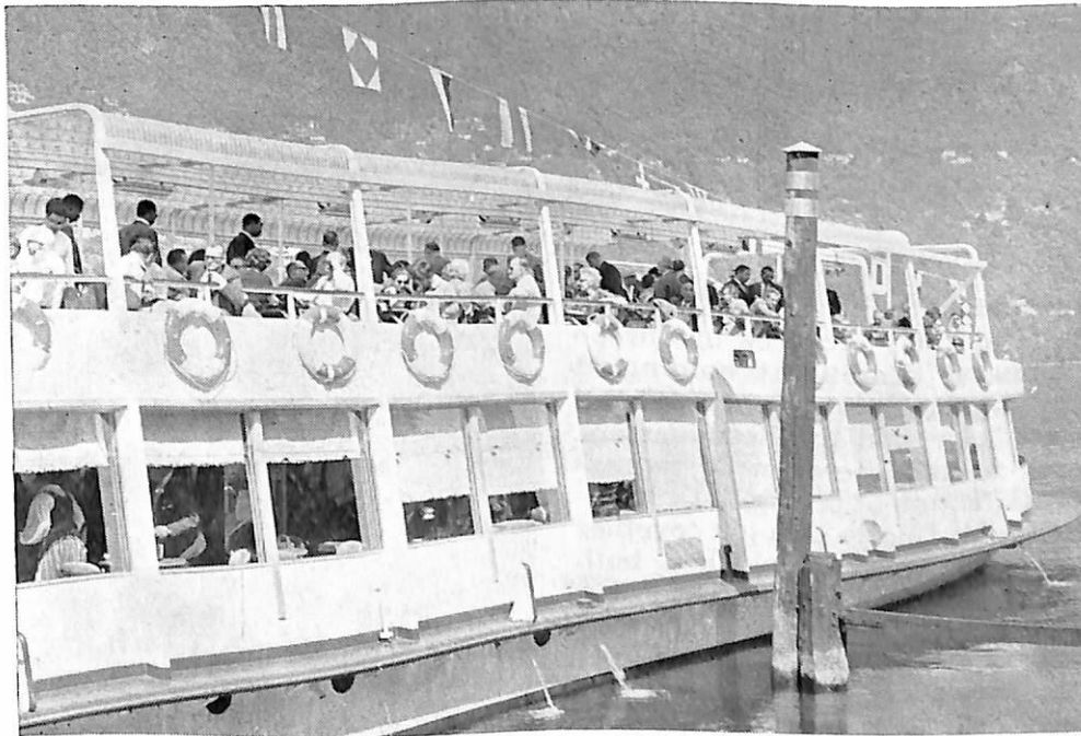
Delegates' excursion on Lake Maggiore.

In the evening, an imposing buffet dinner was given at the Hotel Palma du Lac. On torch-lit porches the long tables laden with elaborate dishes offered a spectacle which attracted a crowd of evening strollers and