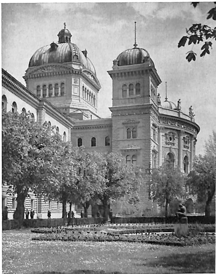
Berne. The Federal Palace, site of the 35th General Assembly session of the I.C.P.O.-Interpol.

Modern discoveries and the resulting progress have brought states and continents and their peoples closer together. Experiments, successes and assistance can now be shared across borders to promote mutual understanding between peoples and to strengthen the desire to co-operate more and more closely for the good of mankind. In this context, encouragement and support for international co-operation are aims and ideals which are shared by Switzerland and the countries and peoples which you represent. It would be inconceivable for the progress which has brought so much good and holds so many promises in other domains, not to extend its benefits to the work which, all over the world, falls to the police. Criminal activities know no frontiers and do not respect one form of government any more than another. Technological progress and the development of modern means of communication have contributed to their increase. In this situation, any effort to prevent and combat crime must include a commitment to international co-operation, increased exchanges of information and support for one another across frontiers in the struggle against injustice and crime.