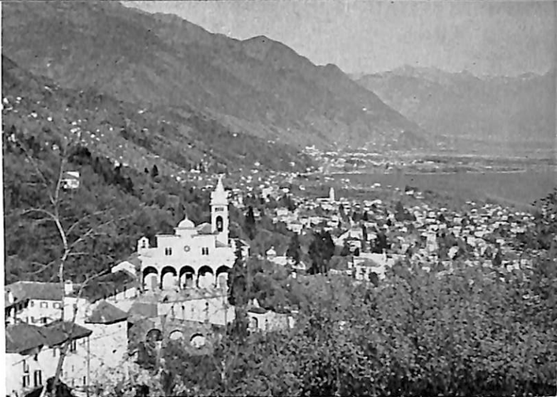
Locarno, la Madonna del Sasso.

— 'How often do police officers turn to the prosecutor in case of doubt? How many police officers even know exactly what happens after the inquiry leaves their hands?'