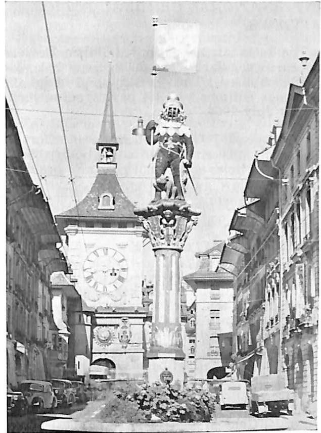
Swiss National Tourist Office.

The library had acquired 144 books and 170 other publications since June 1965, bringing