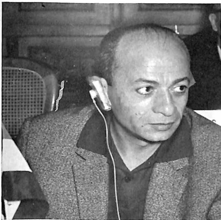
Colonel NAGUIB, delegate from U.A.R., who was elected Vice-President.